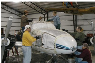
Missionair volunteers working on rebuilding a six passenger aircraft at Garnett, KS airport.

Our goal is to have the aircraft ready for service early in 2009. Plans are being made to use it for clean water projects in Central America as early as Spring 2009.