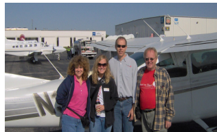
Heart-to-Heart medical workers leave Johnson County Executive Airport for Greensburg, KS

Missionair now supplies air transportation for Heart-to-Heart and Significant Matters and continues to develop relationships with other ministries.